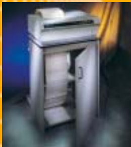
FormsPro 4000se Printstand