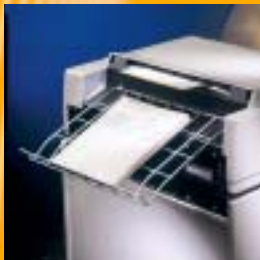
FormsMaster 8000se FormsCutter

A variety of options and accessories are available for the FormsPro 4000se Series and FormsMaster 8000se Series printers. Not only do these items enhance the functionality of the printers, they also help solve tough printing challenges.